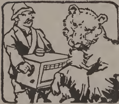
The Man Sang, and the Bear Danced.

PERHAPS being brought up with Jack and entering into all the things that Jack did had made Evelyn very fearless. Jack never tried to frighten her, so that she never thought about being afraid of anything. He would take her for wonderful coasts in the express carts, and as long as Jack did the steering Evelyn always felt absolutely safe.